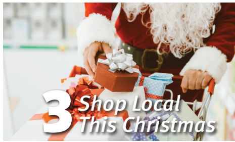
3 Shop Local This Christmas