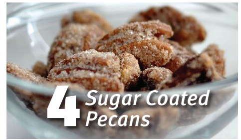
4 Sugar Coated Pecans