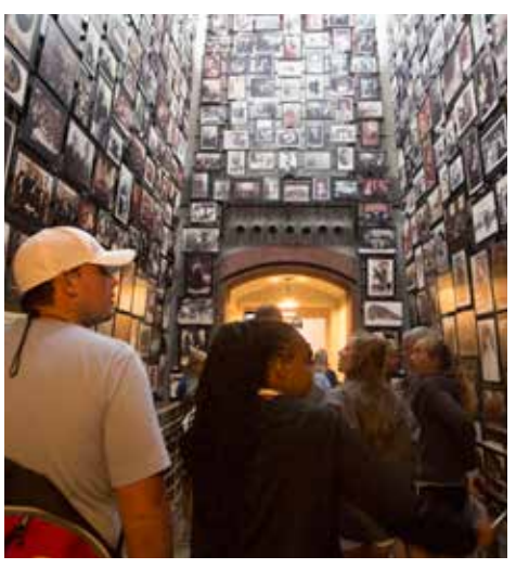
The wall of faces at the Holocaust Museum holds photos of the many Jewish families and communities killed during Hitler's reign.