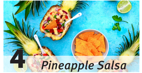
4 Pineapple Salsa