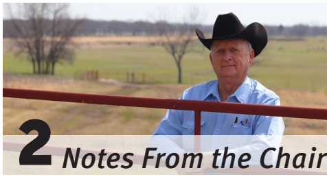
2 Notes From the Chair