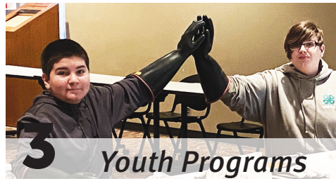
3 Youth Programs