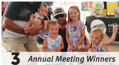
3 Annual Meeting Winners