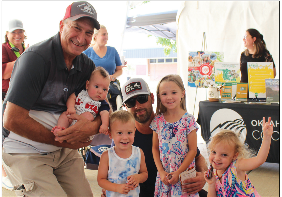
East Central Electric Cooperative met quorum at the 2022 Annual Meeting with 1,632 members registered and several future members in attendance.