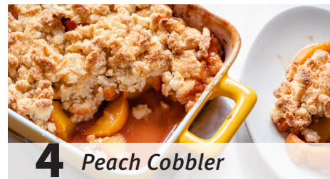
4 Peach Cobbler