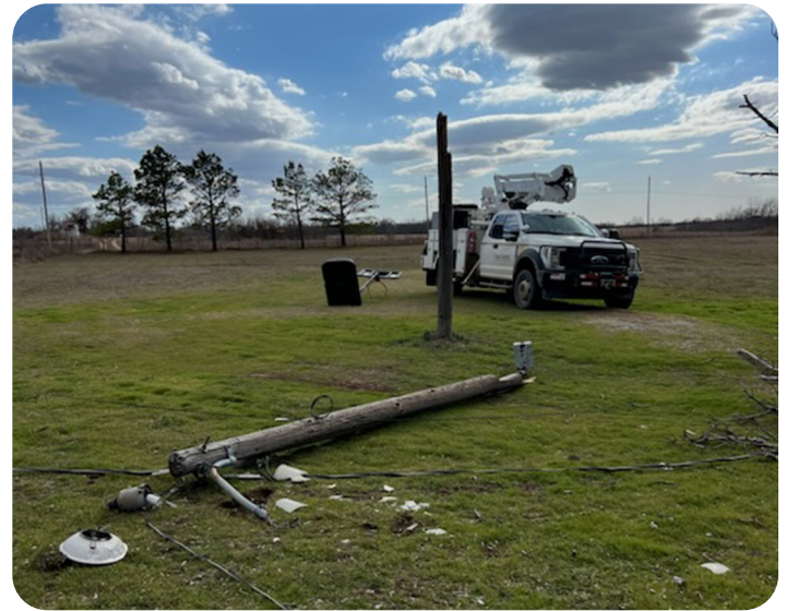
ECE crews (behind the camera) assessing damage after a spring storm.