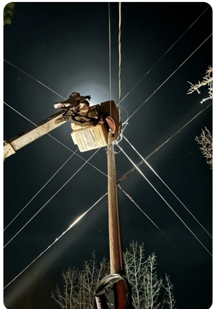
Illuminating the work site on a late night outage.