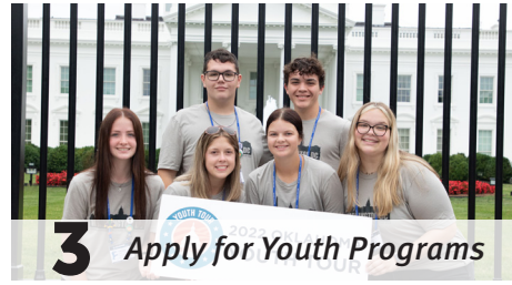
3 Apply for Youth Programs