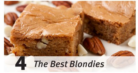
4 The Best Blondies